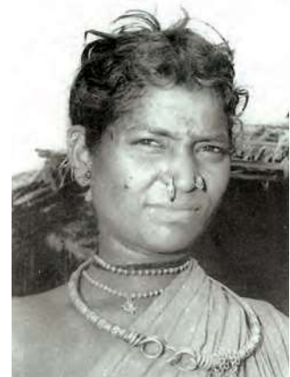
Fig. 5 A Gond woman.

The administrative system of these kingdoms was becoming centralised. The kingdom was divided into