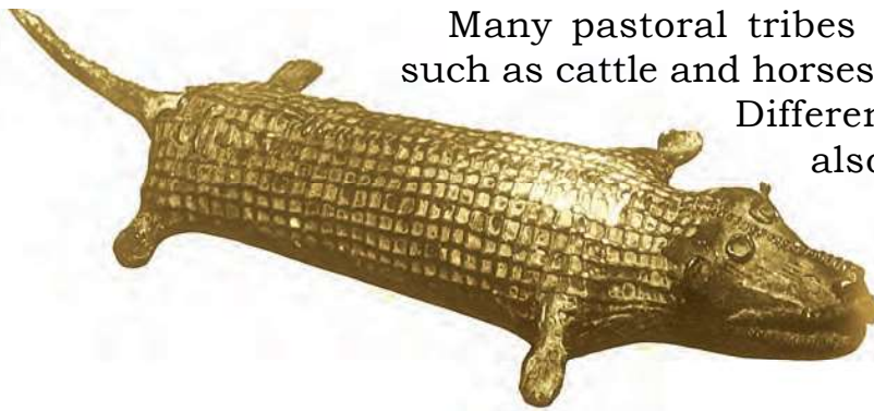
Fig. 4 Bronze crocodile, Kutiya Kond tribe, Orissa.

Many pastoral tribes reared and sold animals, such as cattle and horses, to the prosperous people. Different castes of petty pedlars also travelled from village to village. They made and sold wares such as ropes, reeds, straw matting and coarse sacks. Sometimes mendicants acted as wandering merchants. There were castes of entertainers who performed in different towns and villages for their livelihood.